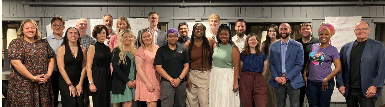
2022-2023 Future Leaders, Mentors and the Future Leaders Academy community (June 18, 2022)